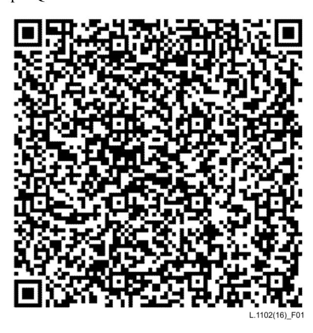
Figure 1 – An example QR code containing information on rare metals

Figure 1 provides an example QR code label which contains rare metals information.